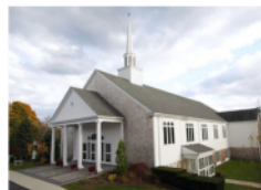
Saint Anthony of Padua Church 26 Hammond St. Mattapoisett, MA