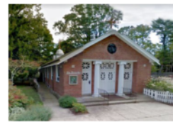
Saint Rita of Cascia Church 121 Front St. Marion, MA