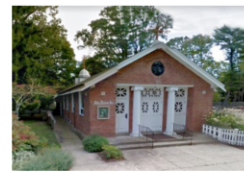
Saint Rita of Cascia Church 121 Front St. Marion, MA