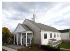
Saint Anthony of Padua Church 26 Hammond St. Mattapoisett, MA